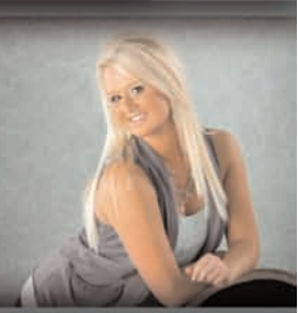
Backdrop: Chevron Mint