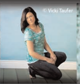
Backdrop: Reflection Watercolor Floor: Wallace Green